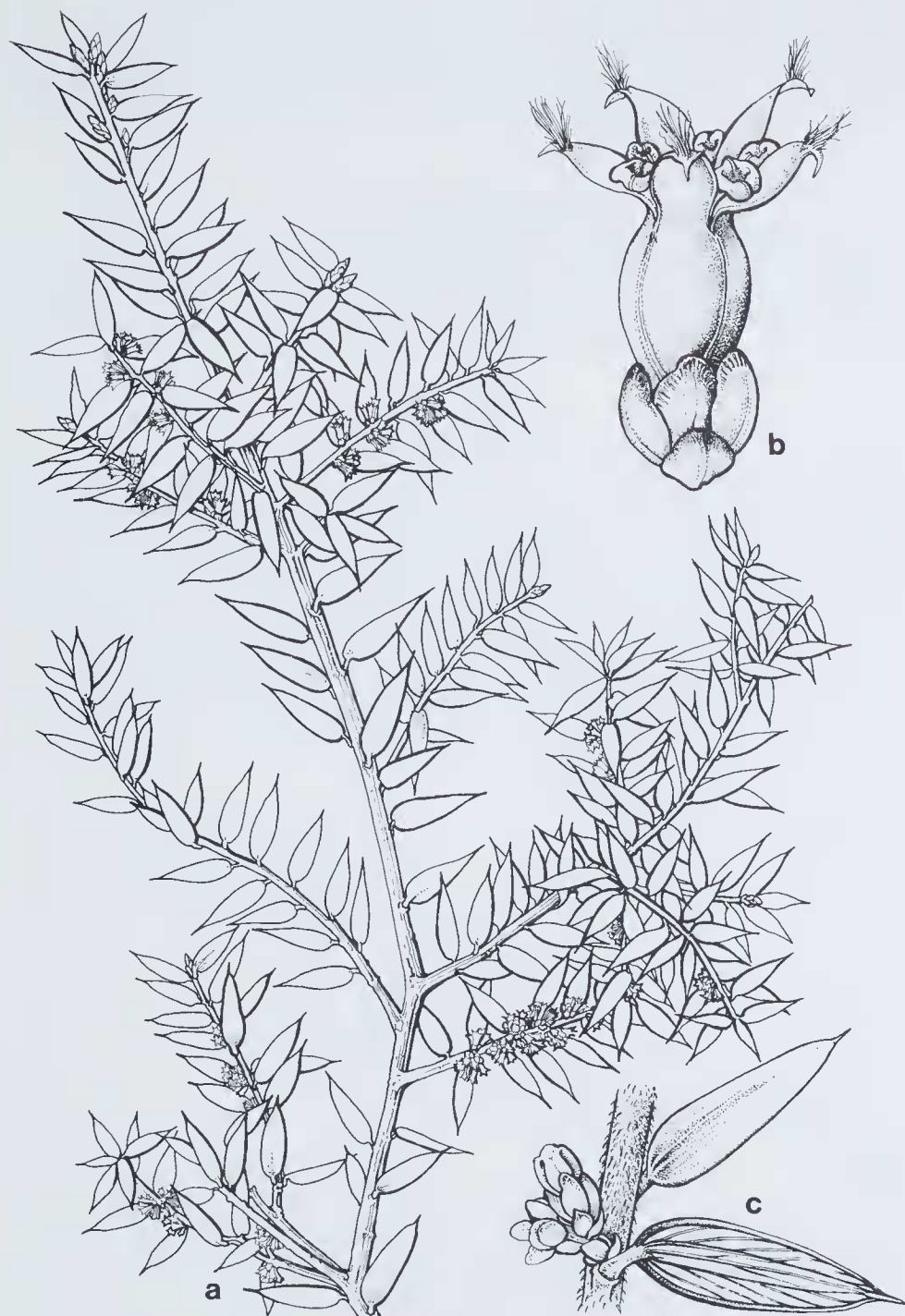
Fig. 1. Acroiriche leucocarpa . a—Flowering branch, \times 1 . b—Flower, \times 20 . c—Leaf and young buds, \times 4 . All drawn from type collection.